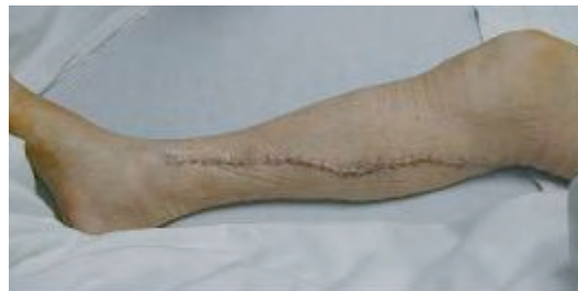
Post CABG Harvest Site

Patients reported less pain and discomfort during activity.