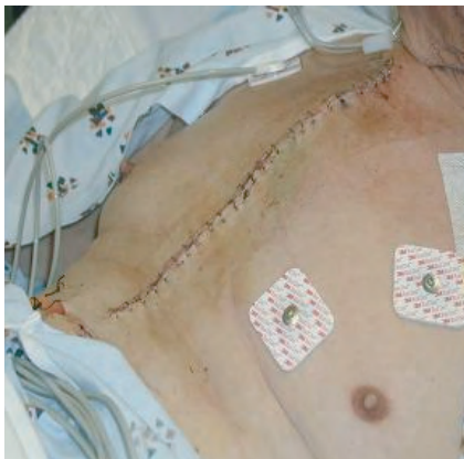
Post CABG Chest

At 72 hours there is a dramatic reduction in inflammation and ecchymosis .