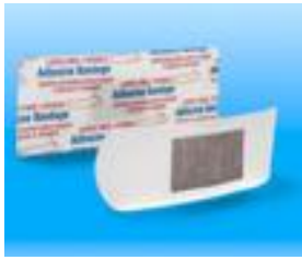
(Purchase Silver Adhesive Strips)