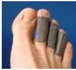
(Purchase Wound Dressings for the Fingers, Toes & Ears)