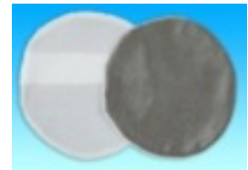
(Purchase Antimicrobial Breast Pad Wound Dressing)

All Easy Ag ® /Silverlon ® Wound Care Products provide the safest and strongest multi-day antibacterial, antifungal, and antimicrobial protection available today. Easy Ag ® can be used safely on anyone with burns, cuts, abrasions, blisters, skin rashes, animal bites, and insect bites for primary First Aid. It has often been reported that when used quickly after injury, Easy Ag ® Adhesive Strips and Bandages help reduce swelling, inflammation and pain.